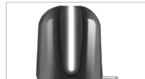
Built-in LED light