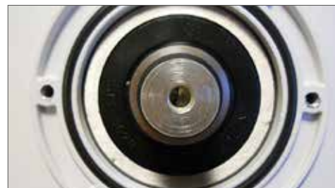
Robust gear reduction with self-standing bearing