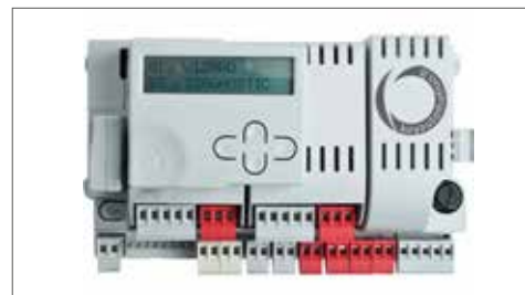
Control board 14A