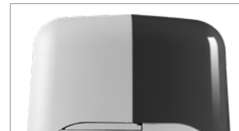
Stylish design screwless at sight